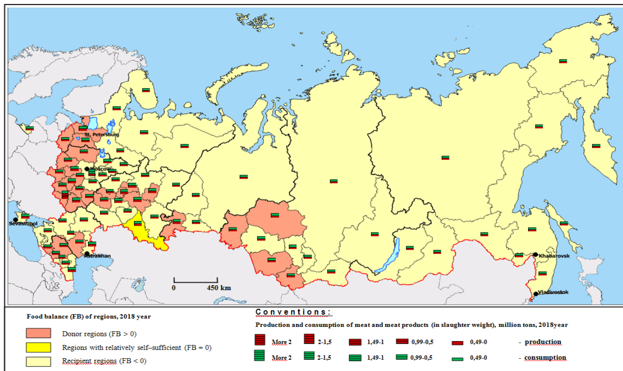
Figure 2. Food balance of meat and meat products (in slaughter weight) of the regions of the Russian Federation [Compiled by the author]

For this type regions the poultry meat predominates in the structure of production of all types of meat - 47.2%. The remaining recipient regions (57 regions) with a negative food balance are characterized by an excess of consumption indicators over meat production indicators. For example, federal cities – Moscow, St. Petersburg and the Moscow Region - stand out from the territories with an increased consumption index, as combining the lack of established production and a high demographic burden.